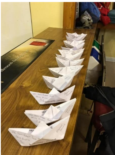
SLOW FLEET TROPHIES 2019

We also had a prize giving event, where we had to improvise our trophies and the winners accepted them with good humour.